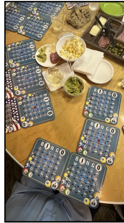
I need room for more cards!

Every Tuesday night at the Rec Center. It starts at 7:15pm and cards are $1 each, which are good for ten games! Please, no big bills. There are also some interesting take-offs on regular BINGO. Cash prizes are an added bonus.