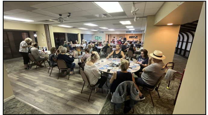
Over 50 people in attendance for Tuesday Night Bingo. What are you waiting for?