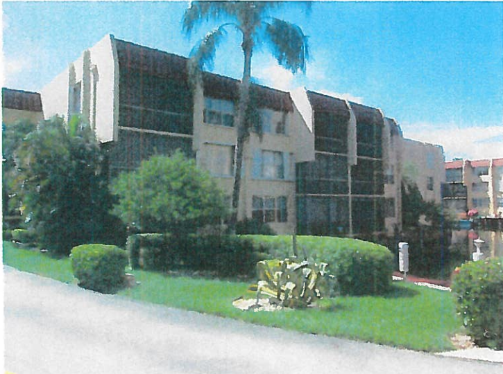
REAR VIEW 9/1/15