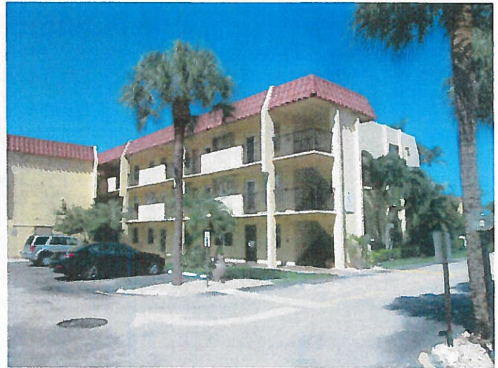
FRONT VIEW 9/1/15