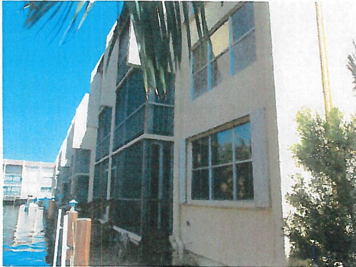
REAR VIEW 9/1/15