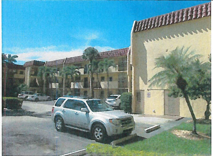
FRONT VIEW 9/1/15