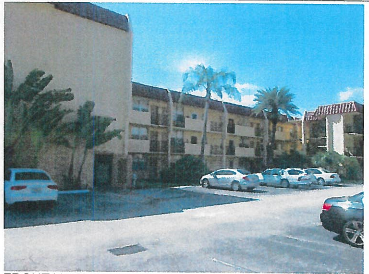
FRONT VIEW 9/1/15