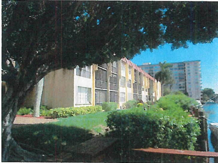
REAR VIEW 9/1/15