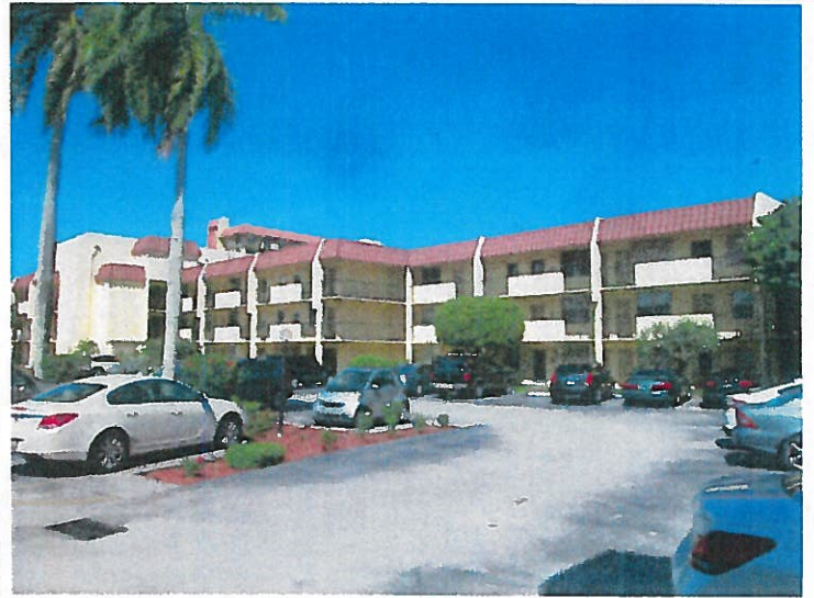
FRONT VIEW 9/1/15